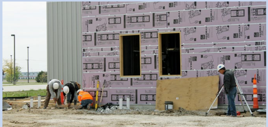
A 14,100-square-foot building for Northwest Electric is being constructed in Waverly.

The electromechanical sales and service facility provides