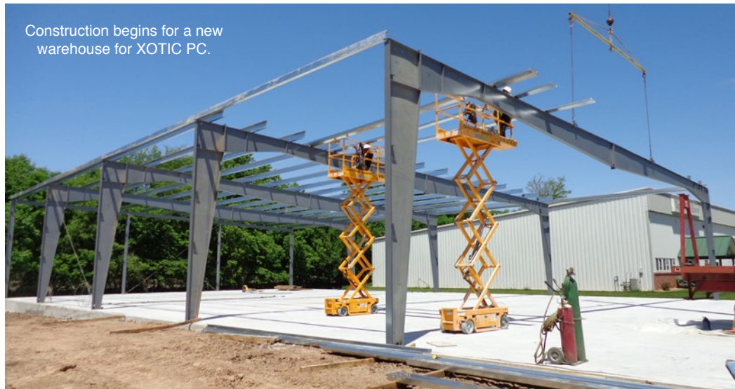
Construction begins for a new warehouse for XOTIC PC.

company, having this warehouse constructed and hopefully building a larger one soon after that,” he said.