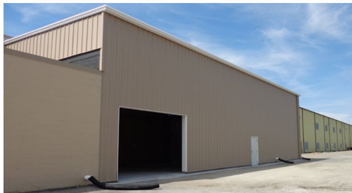
An extension on Distribution Inc.’s building will allow maintenance employees to work on trucks and trailers year-round.